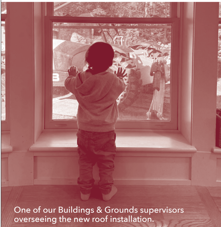
One of our Buildings & Grounds supervisors overseeing the new roof installation.